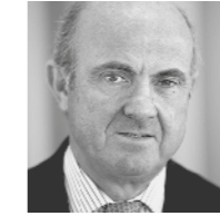
Luis de Guindos