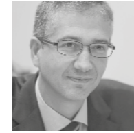
Pablo Hernández de Cos