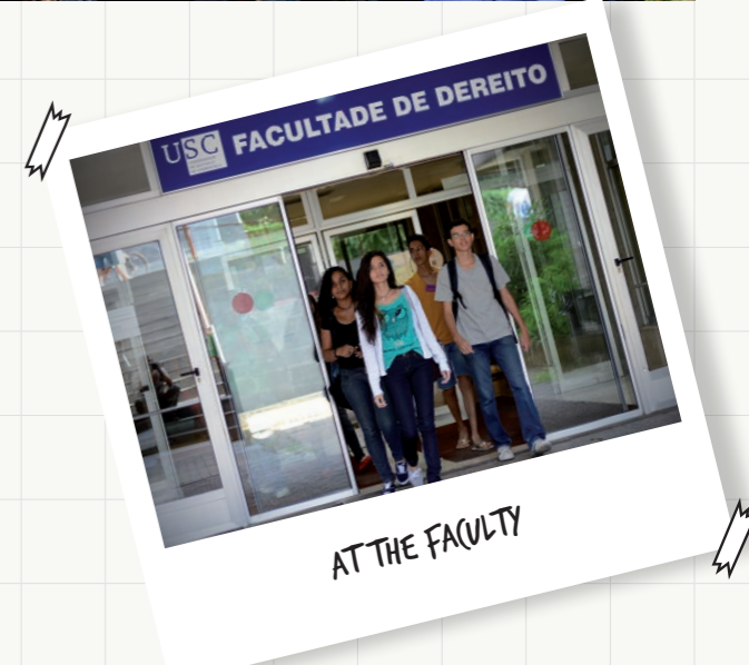
AT THE FACULTY